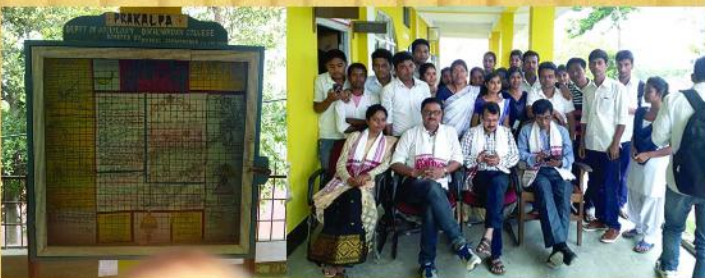
SOCIOLOGY : Inauguration of wall Magazine PRAKALPA.