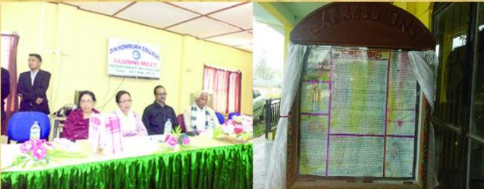
ENGLISH : Inauguration of wall Magazine EXPRESSION.