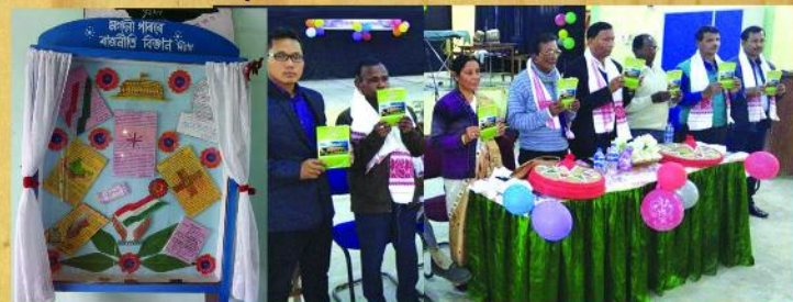
POL. SCIENCE : Inauguration of wall Magazine MOGLOW and Magazine POLITIKAS.