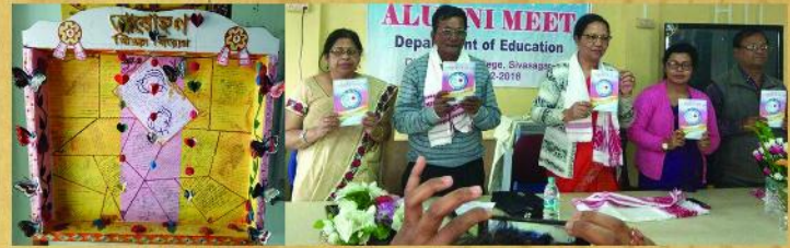
EDUCATION : Inauguration of wall Magazine AROHON and Journal PROYASH.