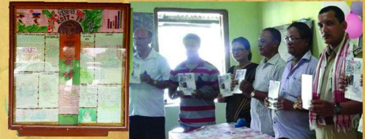
ECONOMICS : Inauguration of wall Magazine UTTARAN and Departmental Journal INDEX.