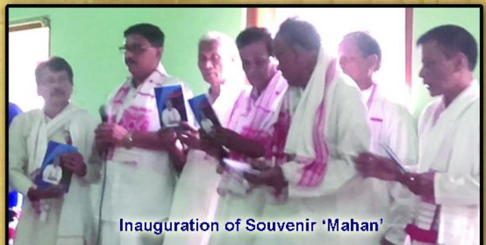
Inauguration of Souvenir 'Mahan'