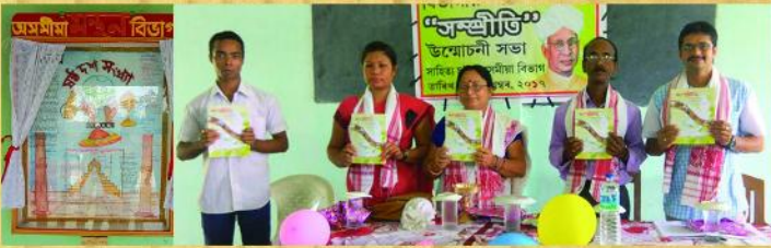
ASSAMESE : Inauguration of wall Magazine MANTHAN and Journal SAMPRITI.