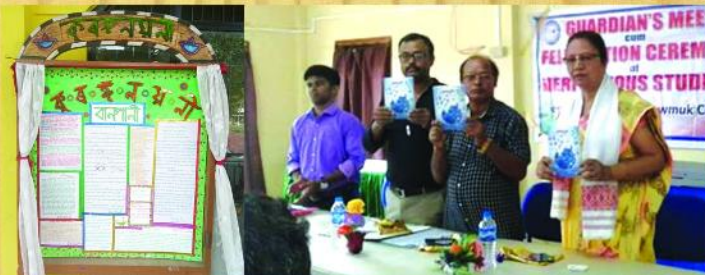
HISTORY : Inauguration of wall Magazine and journal KURANGANAYANI.